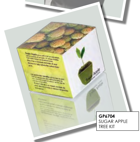
GP6704 SUGAR APPLE TREE KIT