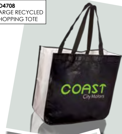
TO4708 LARGE RECYCLED SHOPPING TOTE

However you modify the campaign to suit the needs of the dealership, the empirical evidence is showing that the effectiveness of tote bags in the mainstream promotional media mix is a winning solution. Try this campaign with insurance companies, truck dealers, car-rental companies, parts manufacturers, and a host of other companies. Good luck!